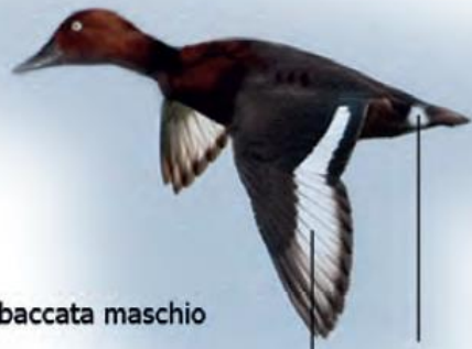
moretta tabaccata maschio