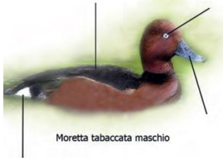
Moretta tabaccata maschio

Le morette tabaccate in volo sono distinguibili per il sottocoda e la fascia alare bianca, che è curva e più larga che nelle morette. La silhouette della tabaccata è più sfilata e il collo appare più sottile, il volo è agile con possibili scarti repentini. Ha il ventre bianco sfumato.