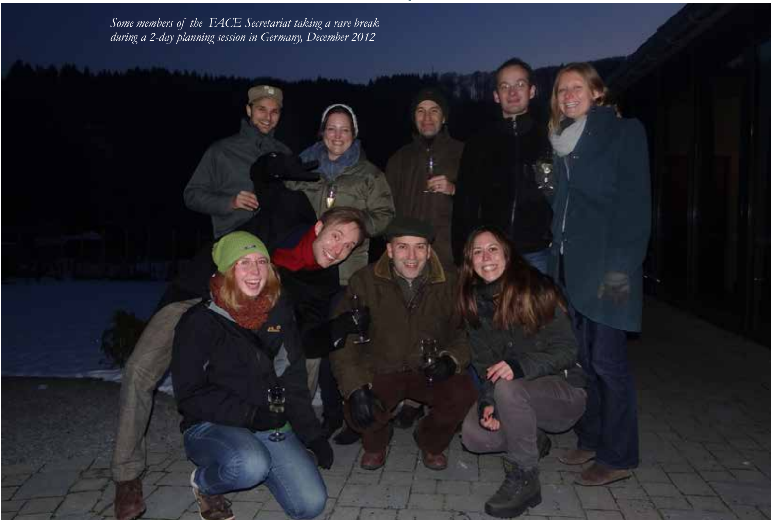
Some members of the FACE Secretariat taking a rare break during a 2-day planning session in Germany, December 2012

Communications Internship, July-August 2012