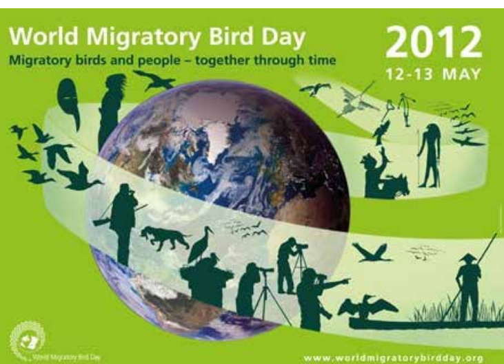
Spot the hunters: the official poster

Overall FACE has increased its involvement with the CMS and seeks to enhance more conservation-orientated objectives in which environmentalists and hunters can join forces in more meaningful ways.